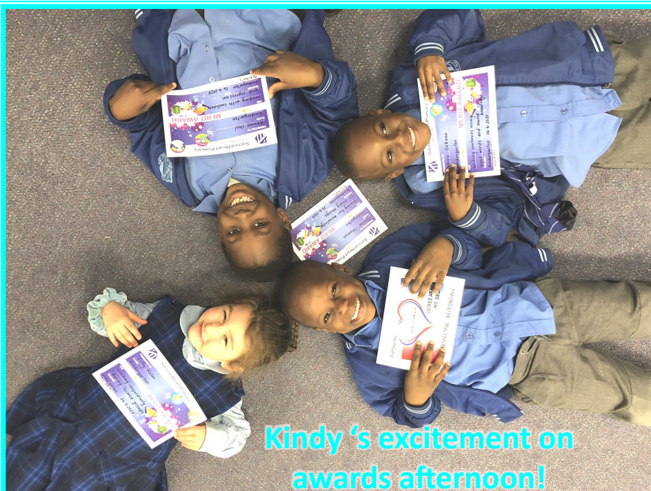
Kindy 's excitement on awards afternoon!

Once again we request your cooperation with this important request.